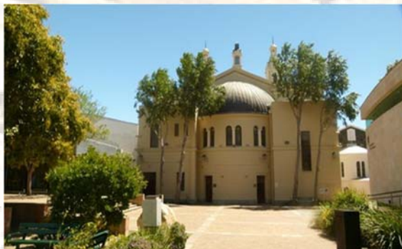
Gardens Shul campus