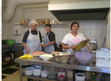
The staff of Café Kaplan

021 430 4811; Piazza St John, Main Road, Sea Point