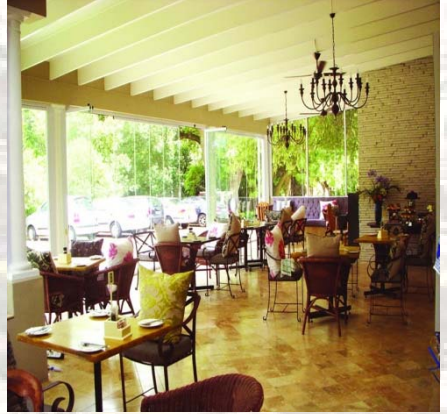
Coffee Time restaurant

021 439 0913/4 Fax: 021 439 0914; Piazza Da Luz, 94 Regent Rd, Sea Point